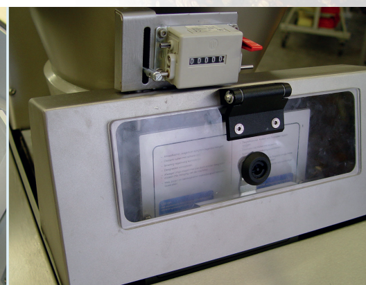
Mechanical stroke counter