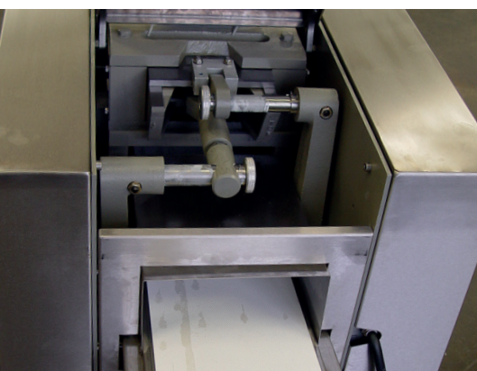
Heart of the divider